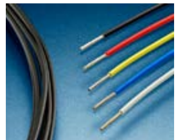
Wire & Cable Products