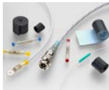
Harness & Cable Protection