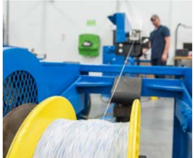
Re-spooling capabilities for right-size quantities of wire and cable products