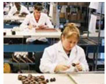
Assembly for Connectors